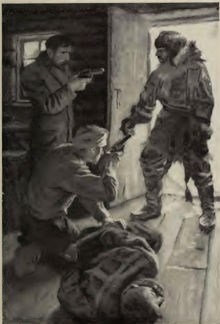
Two shining muzzles were leveled at his breast